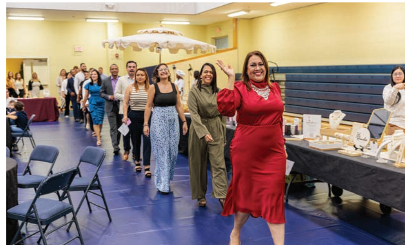
ABOVE & RIGHT: Spring 2025 Academy Graduation.

Sustainability principles, covering aspects related to ecological and social well-being in addition to community engagement, are crucial in shaping a company's long-term objectives and commitment to social responsibility. Functioning as a facilitator of genuine growth and development, Charleston County Economic Development is dedicated to elevating community success and promoting economic growth. Our office serves as a catalyst for local businesses and organizations, offering support and guidance to help them achieve their sustainability objectives.