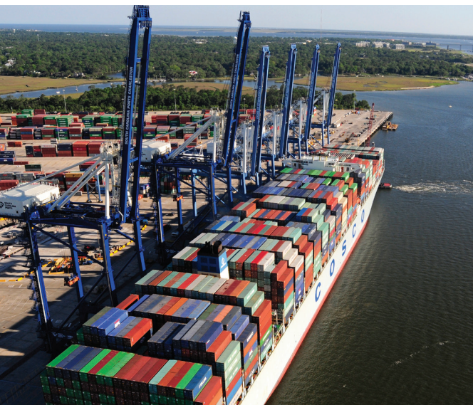
South Carolina Ports Authority