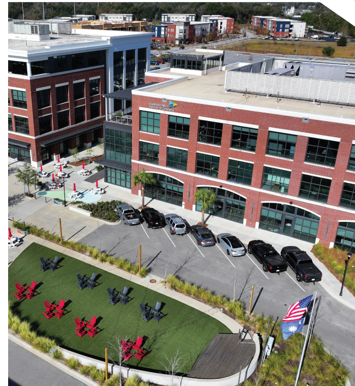
Charleston County Economic Development Office

Figuring out who to contact when starting a business can be time-consuming. Let us connect you with the right person at one of our major municipalities.