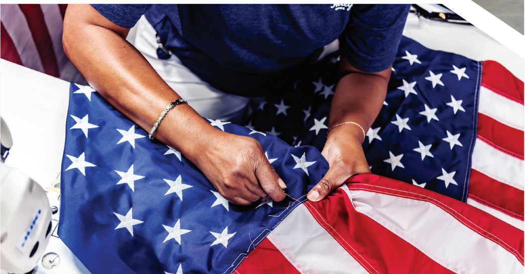
Allegiance Flag Supply

“We are beyond excited about this new expansion. Charleston County has been our home and with this new chapter for Allegiance, we’re hopeful that it will continue to be for a long time. We’ve still got a lot of growth to go and we’re hopeful the positive benefits of that growth will continue to reverberate loudly across the community.”