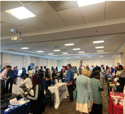
Charleston County Career Fair