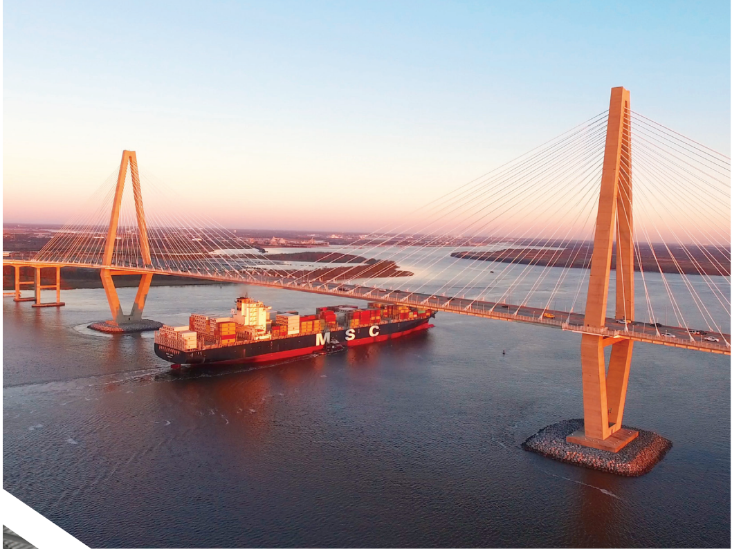
MSC - Mediterranean Shipping Company

This meeting, which is exclusive to companies located in Palmetto Commerce Park, is a great way to engage with business neighbors and receive specific business park updates.