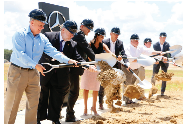
Mercedes-Benz Vans Groundbreaking Ceremony