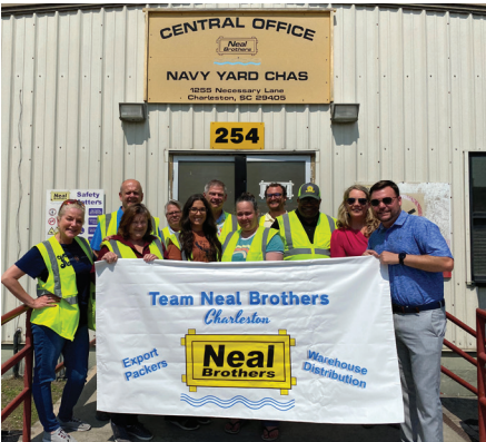
Neal Brothers Charleston, Inc.