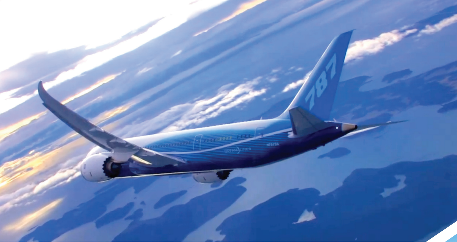
Boeing South Carolina