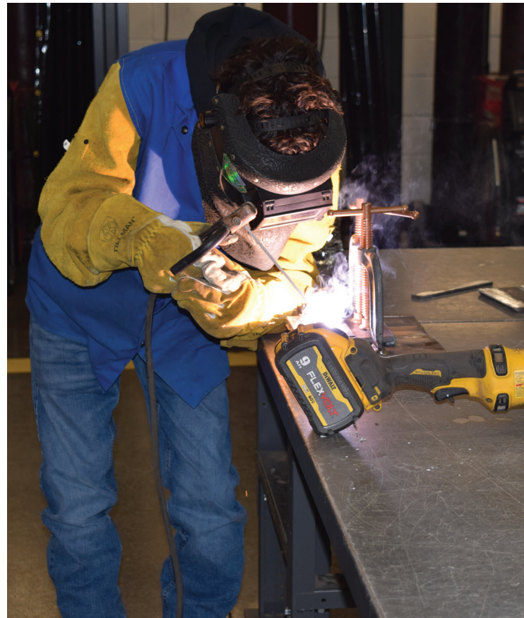
Charleston County School District Centers for Advanced Studies