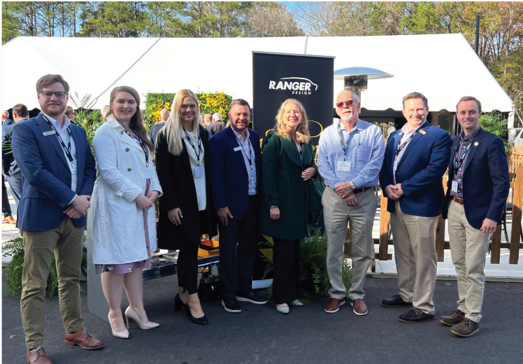
Ranger Design Ribbon-Cutting